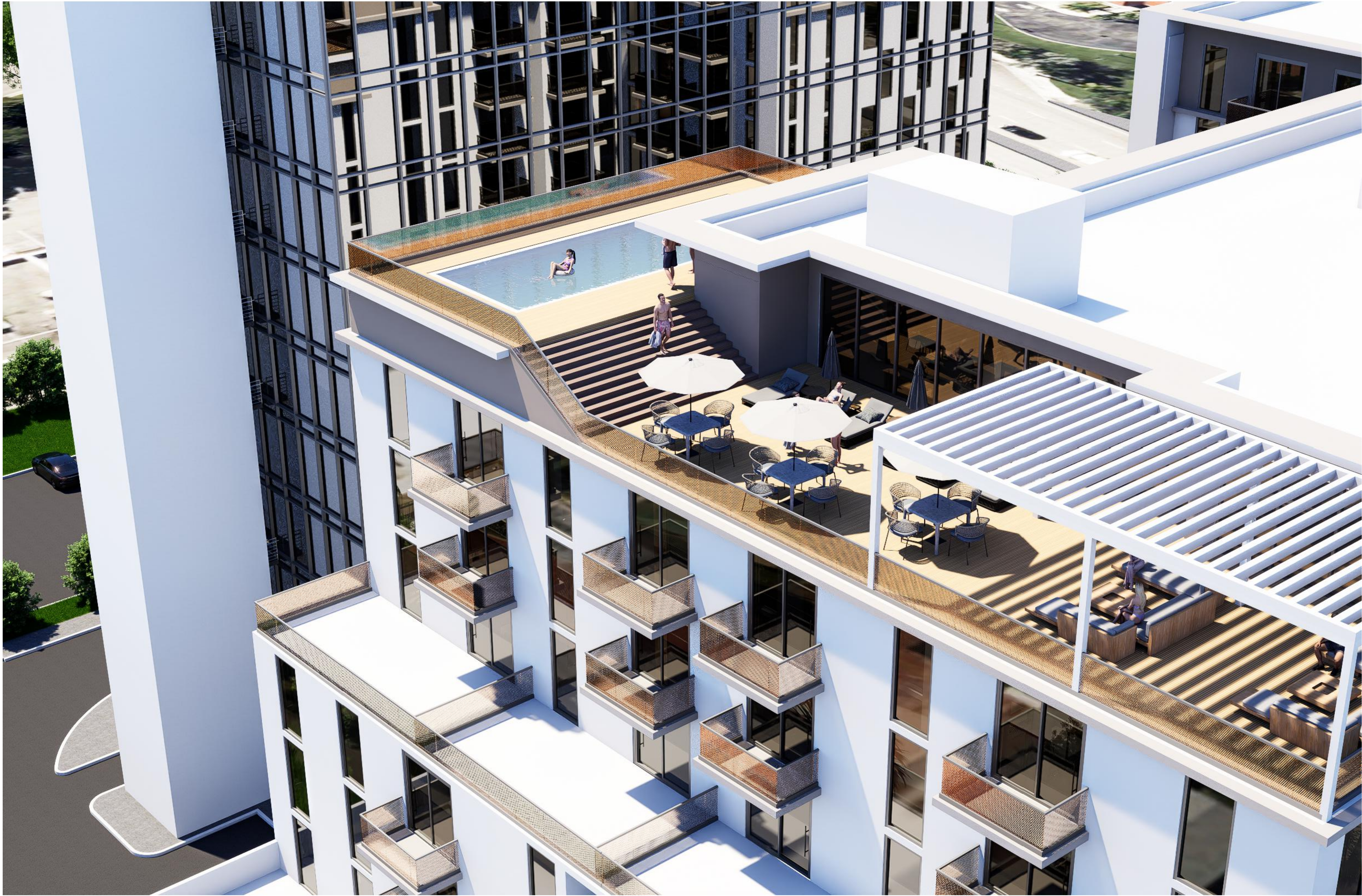
ZOOM-IN VIEW OF THE ROOFTOP POOL